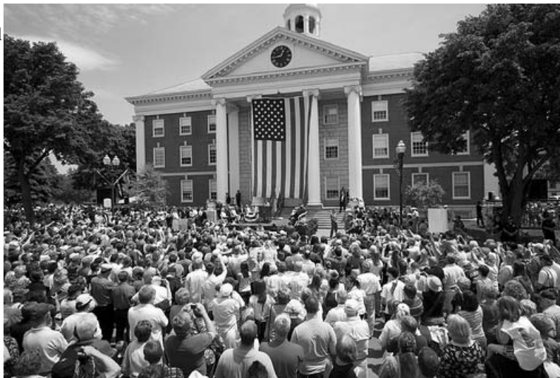
A large crowd gathers in front of Memorial City Hall to hear Alaska Governor Sarah Palin speak during Founders Day ceremonies.

Governor Palin then said a few words about the beauty of Auburn and about the important role Seward and this region played in not only (continued on page 5)