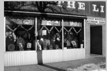
The Liberty Store