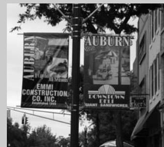
2003 Downtown Auburn Banner Program.